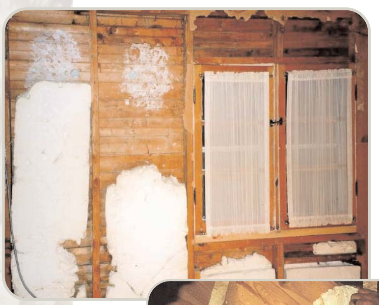
Images of UFFI above courtesy of Carson Dunlop. Copyright 2003, Carson, Dunlop & Associates Ltd.

properly. According to the federal government, there are no concerns about vermiculite causing damage to a house. It is estimated that between 200,000 to 300,000 homes had vermiculite insulation installed, but there is no estimate as to how many of those homes were insulated with Zonolite®.